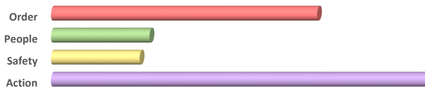
Team Communication Tendencies

Relative influence of each motivation in team communication with other individuals and teams.